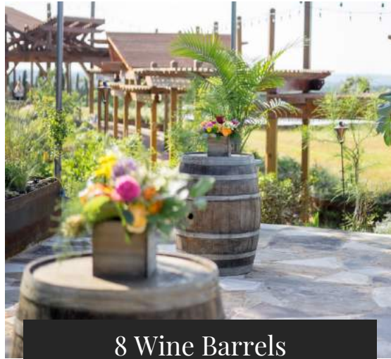
8 Wine Barrels