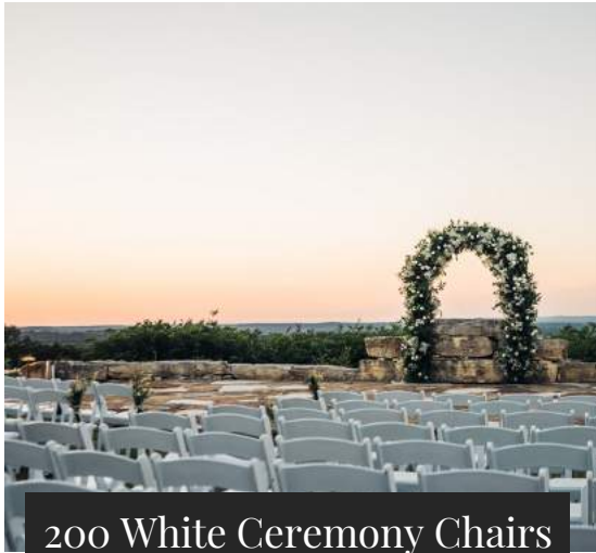
200 White Ceremony Chairs

The following items are included in each of our Wedding Packages. ($4,000 value.)