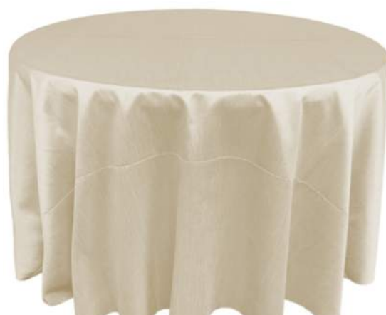
120" Round Tablecloths