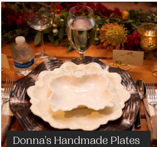
Donna's Handmade Plates