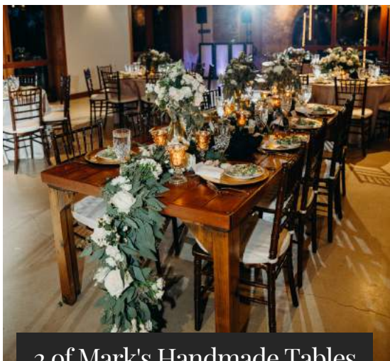
2 of Mark's Handmade Tables