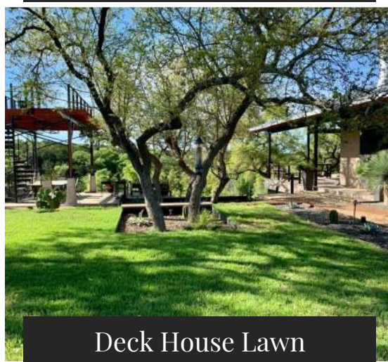
Deck House Lawn