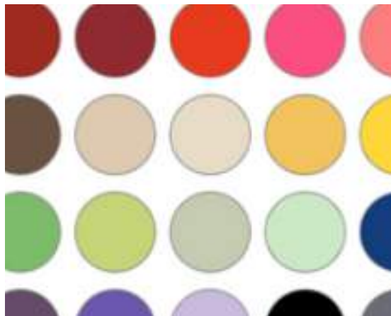
Multiple Color Options