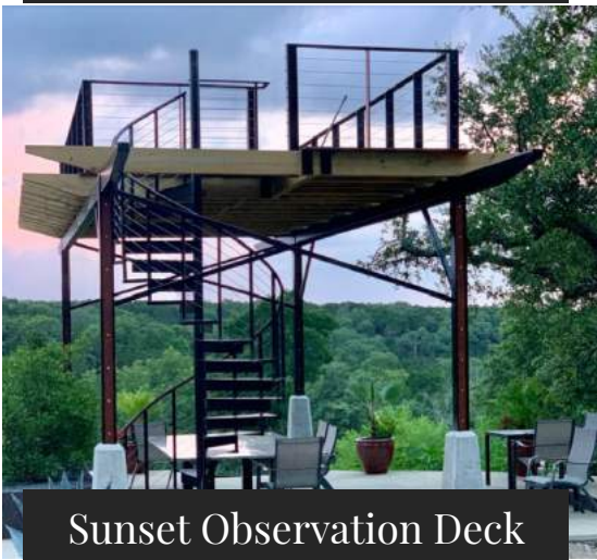
Sunset Observation Deck