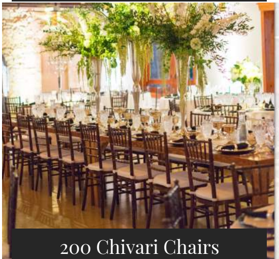
200 Chivari Chairs