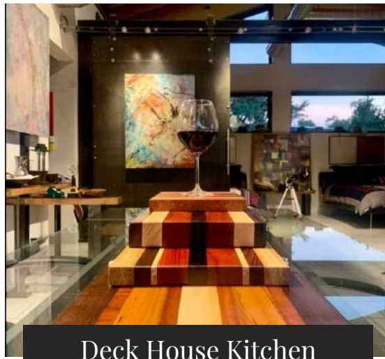
Deck House Kitchen