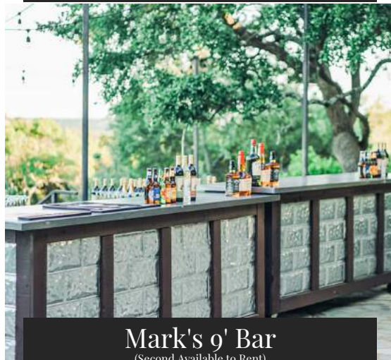
Mark's 9' Bar (Second Available to Rent)