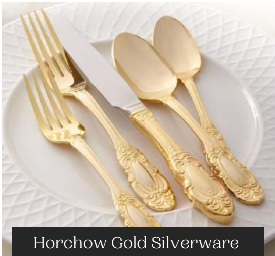
Horchow Gold Silverware