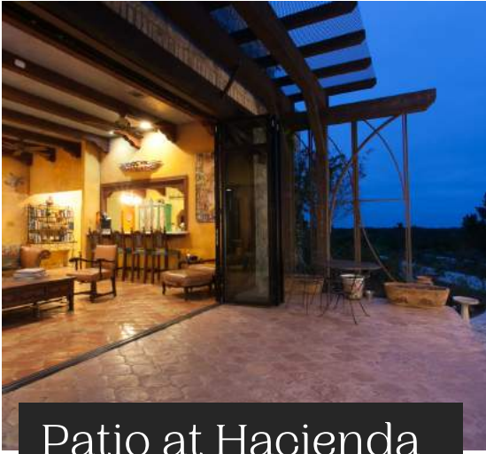
Patio at Hacienda