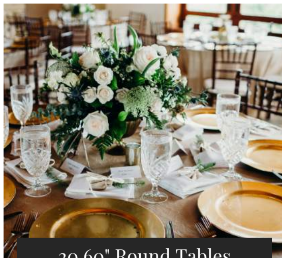
20 60" Round Tables